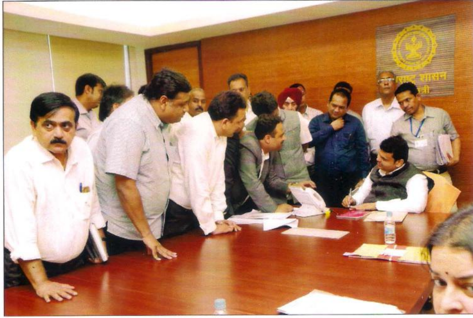
SRAM delegation apprising Hon'ble Chief Minister at their meeting on 02.03.2015 at Mantralaya about the present condition of Steel Industry.