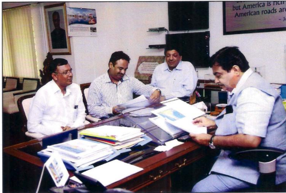
Delegation headed by President apprising the Hon'ble Shri Nitin Gadkari, Highways & Road Transport Minister on 08.06.2015 about the present condition of Steel Industry.