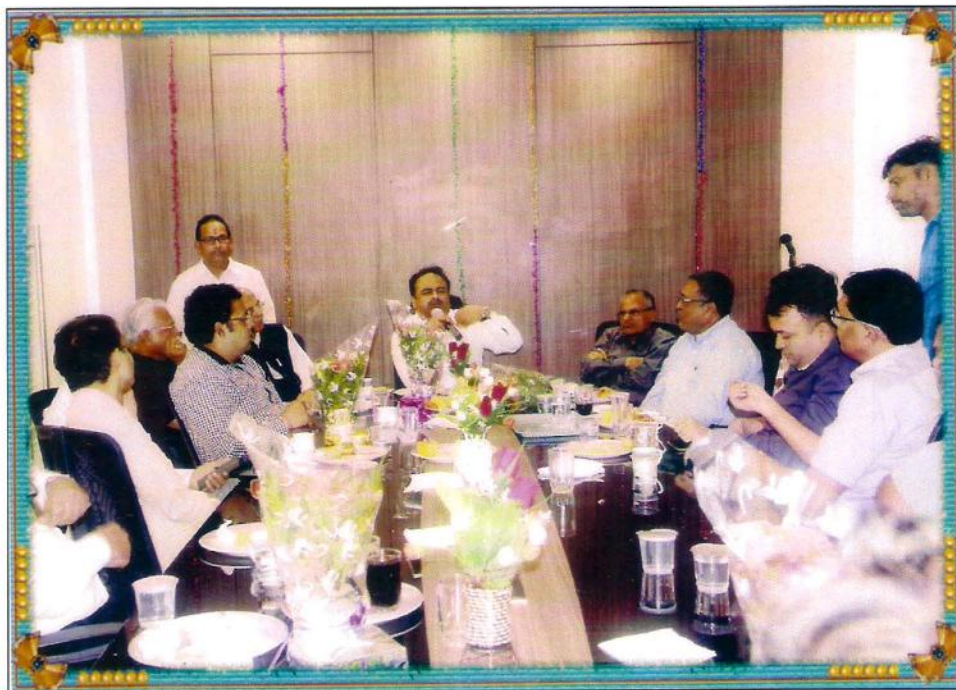
President addressing the members at Inaugural Meeting of SRAM office on 11.12.2015.