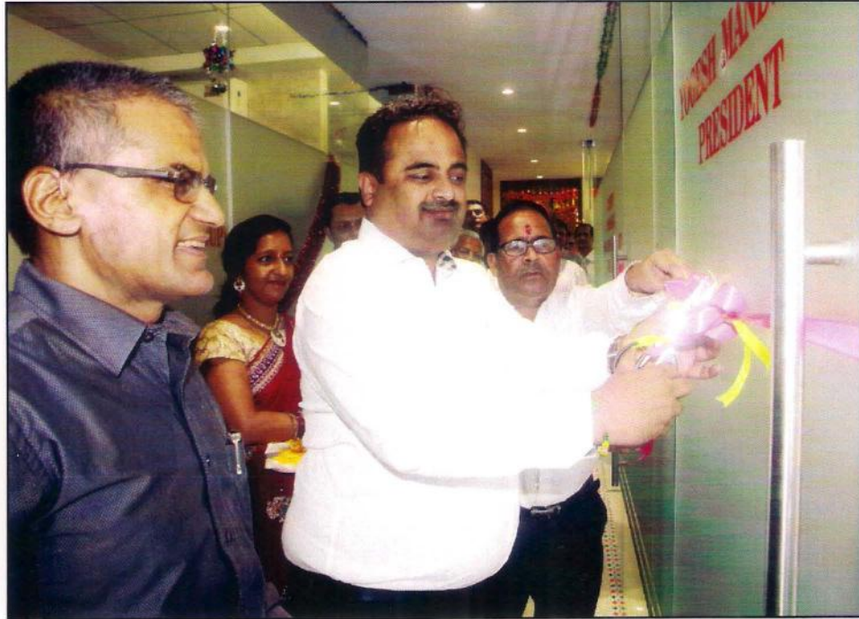
President & Hon.Gen.Secretary Inaugurating SRAM's Newly Renovated Office on 11.12.2015.