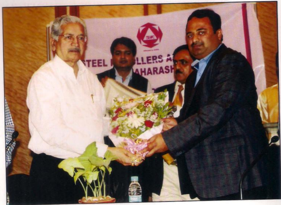
Felicitating Hon'ble Shri Subhash Desai, Ind. Minister, Mah. on 23.01.2015.