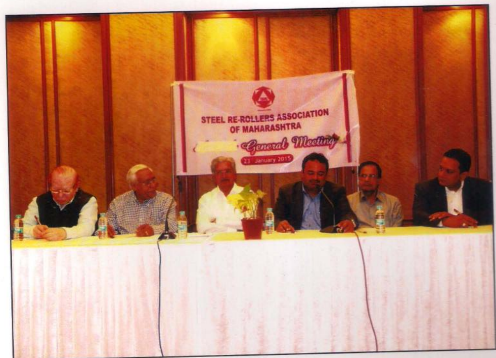
President addressing re-rollers meet on 23.1.2015 - Guest of Honor Shri Subhash Desai.