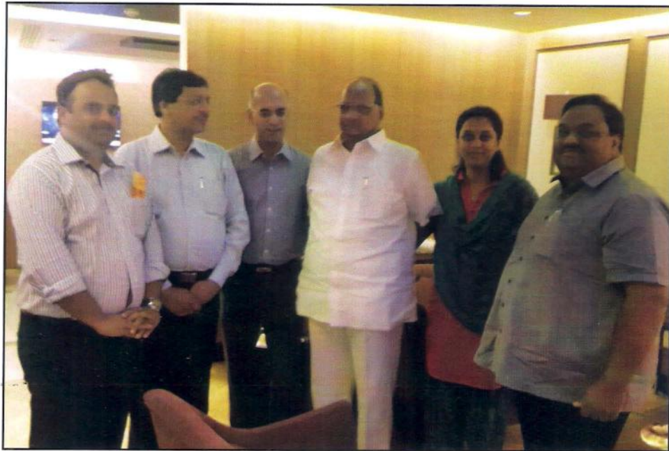
President courtesy meeting with NCP Chief, Sharad Pawar & M.P. Supriya Sule.