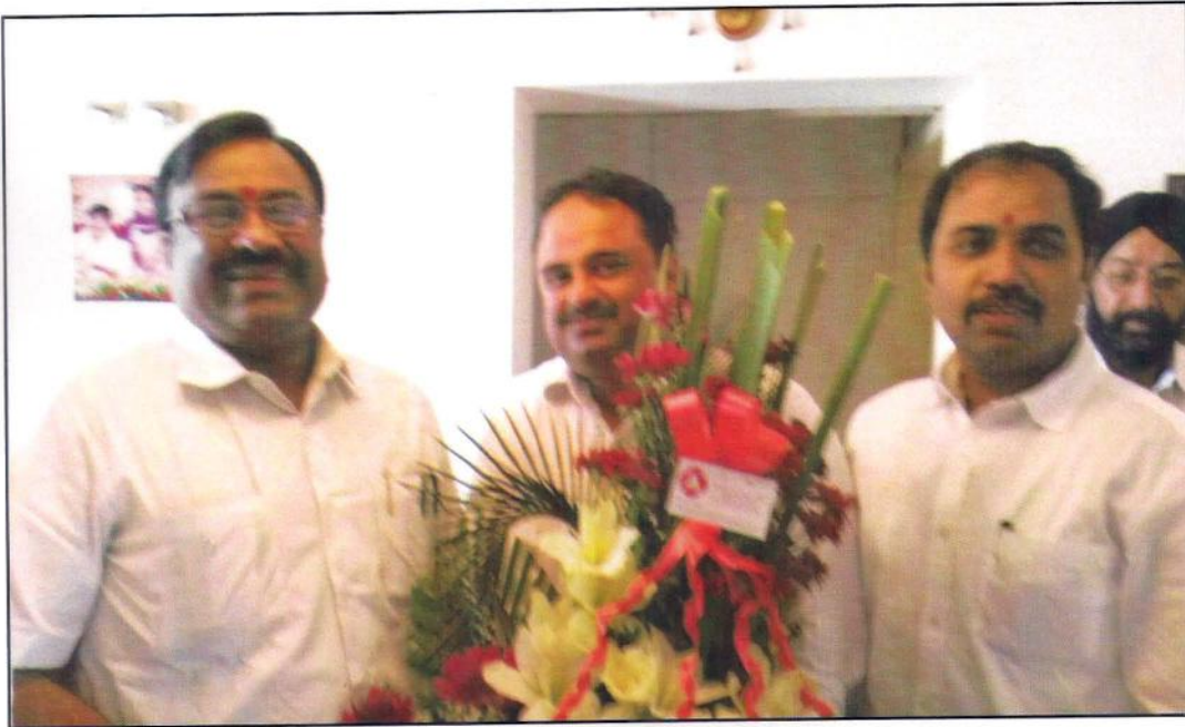
President met Hon'ble Shri Sudhir Mungtiwar, Finance Minister, Mah. with Shri Shabhaji Roa Patil Nilengekar, Minister, Skill Development, Power & Labour.