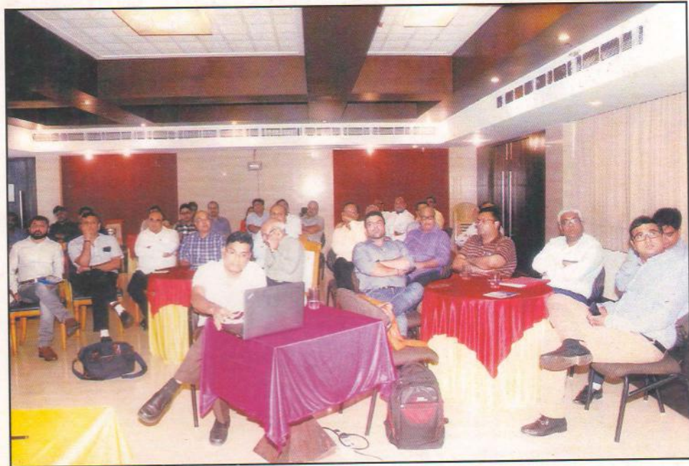
Members attending the GST Seminar on June 21, 2017 at Chembur Gymkhana.