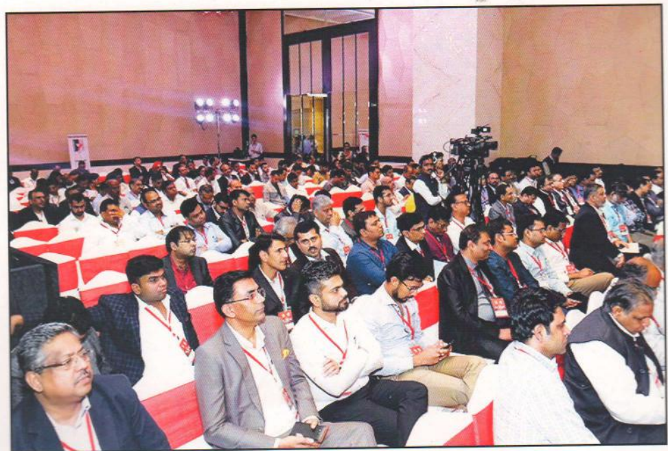
The MSME Steel Conclave 2018 held at Hotel Taj Santacruz Mumbai on 18th May 2018 organized by us was attended by more than 450 participants through out the Country.